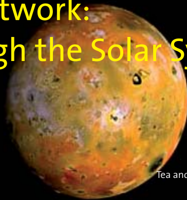
Tea and Coffee at 16:15h